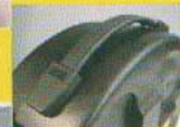
Comfortable Carry handle