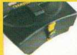
Wider curved base