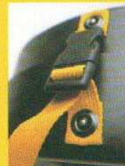
Quick lock clips