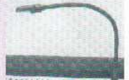
LE-XLR-1 PLUGGED INTO DJ MIXER