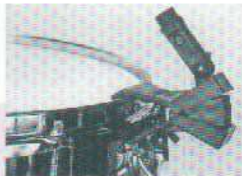
M1 MOUNTED ON SNARE DRUM