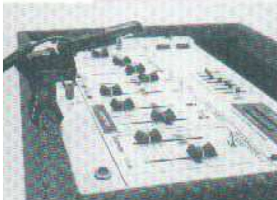
LE-MINI CLAMPED TO DJ MIXER RACK