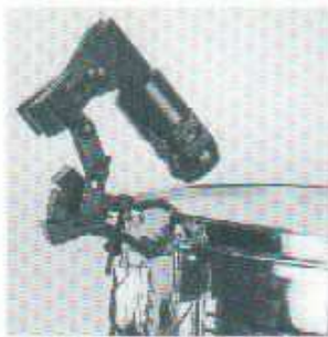
MIN-EZE MOUNTED ON SNARE DRUM RIM