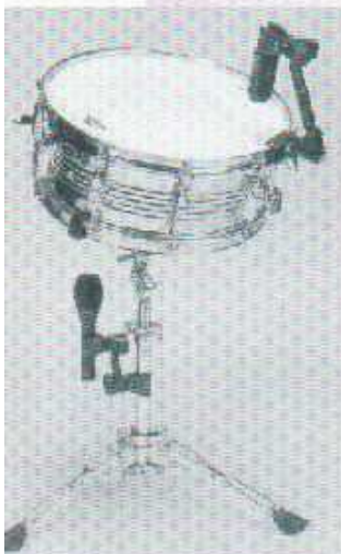
M-1 and M-4 MOUNTED ON ARE DRUM RIM & PIG-E-BAK ON SNARE DRUM STAND