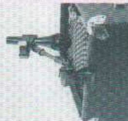
MAX-EZE CLAMPED ON AMP