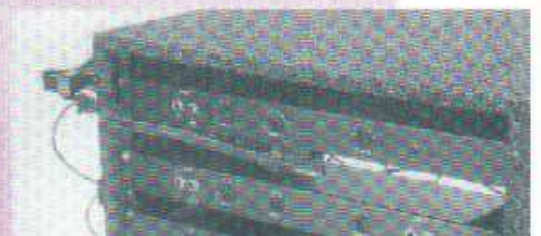
LUMIN-EZE LE-1S MOUNTED ON FRONT OF RACK