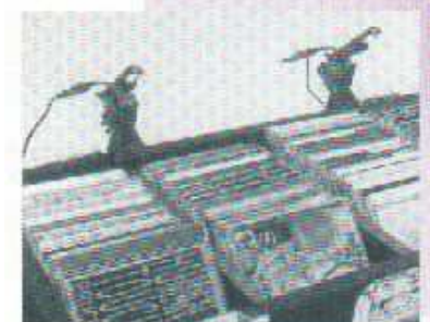
LE-MINI MOUNTED ON CD CASE