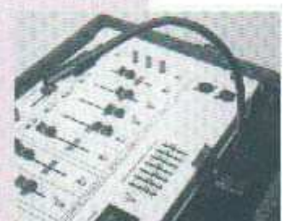
LE-1S CLAMPED TO DJ MIXER