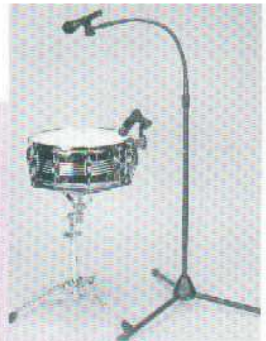
MIN-EZE ON SNARE DRUM, RUBBER-NECK R-20S ON MICROPHONE STAND, AND MIC-EZE M-4 AS MICROPHONE HOLDER