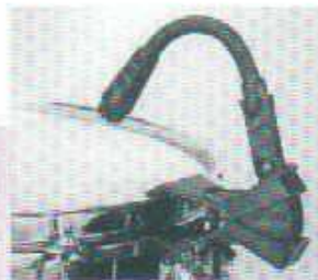
M1-E3 MOUNTED ON SNARE DRUM RIM