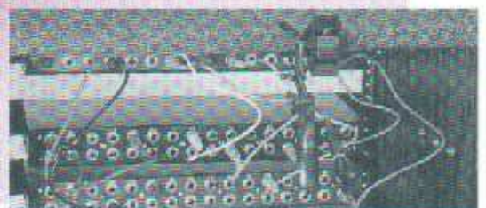
LE-MINI MOUNTED ON REAR OF RACK