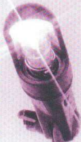
SHOWS WIDE OPENING OF CLAMP