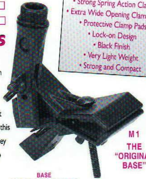
M1 THE "ORIGINAL BASE"